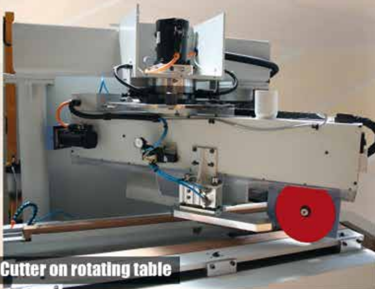
Cutter on rotating table