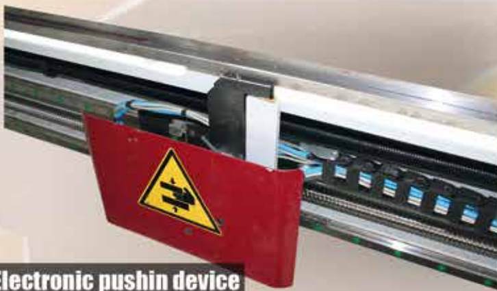
Electronic pushin device